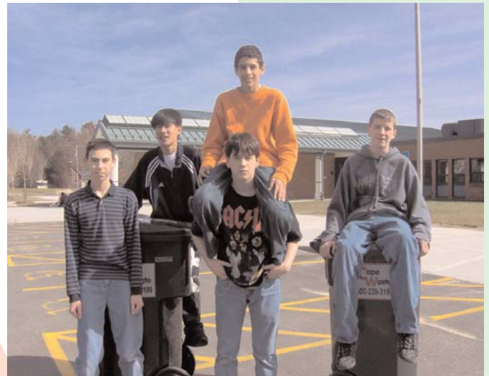
Pembroke Community Middle School Green Team members manage the recycling.