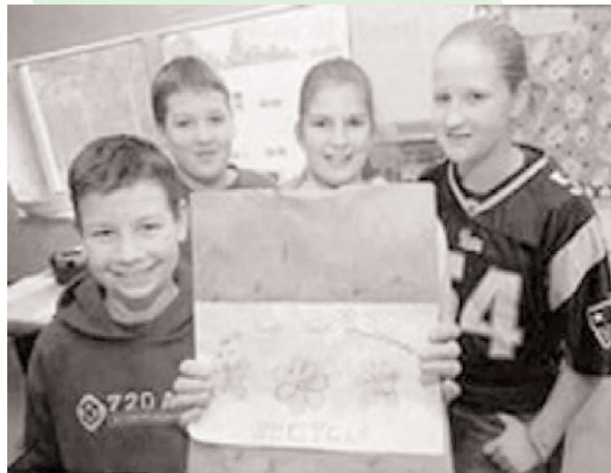
Sixth grade students at Wood Elementary School, Plainville, display their "Recycling Bag."