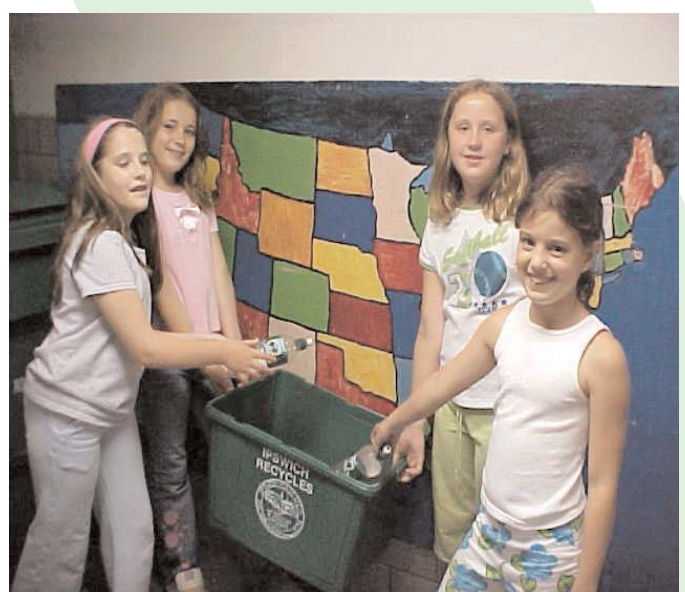
Student Leadership Council Recycling Committee at the Winthrop School.