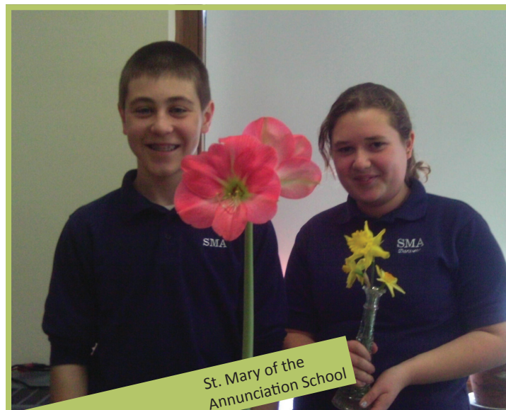
Students have fun with GREEN TEAM in Danvers, MA