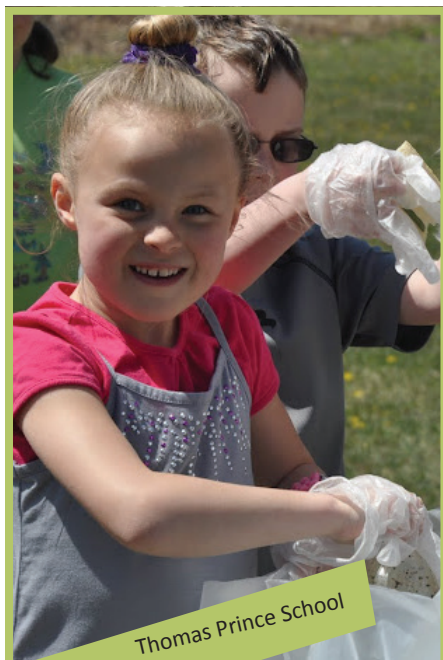
GREEN TEAM makes news in 2012

The Barnstable Patriot reported on the actions taken by schools across the Cape to reduce trash and increase recycling. The September 1st, 2011 article highlights THE GREEN TEAM from Barnstable Intermediate School and their active recycling program.