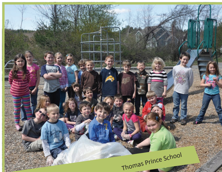
The Thomas Prince GREEN TEAM of Princeton, MA

Fourteen classes were recipients of a grand prize, such as a school-wide performance by "edu-tainer" Peter O'Malley, Jack Golden, or the musical group Earthtunes or a gift card to a local garden center to purchase trees or garden supplies to further "green" their schools. For a complete list of GREEN TEAM prize winners and descriptions of their projects, visit http://www.mass.gov/dep/public/press/0612grte.htm .