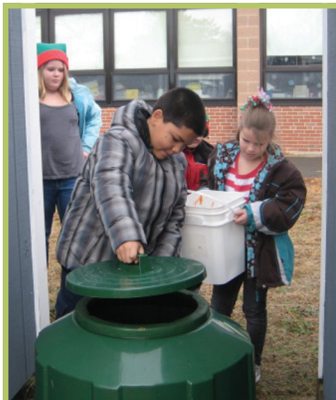
Selser Memorial School in Chicopee