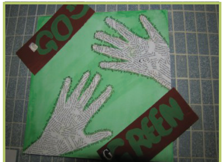
Thomas Prince School students in Princeton Go Green!