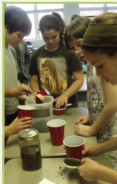
The Thomas Prince GREEN TEAM!

Established in the fall of 2010 at the Thomas Prince School, the Princeton PTA GREEN TEAM innovatively and positively affects more than 400 K-8 students by incorporating environmental education, environmental awareness and environmental stewardship in their daily school activities. THE GREEN TEAM program is innovative in the variety of projects it implements as it affects the daily lives of the students and staff. Through donations from area businesses, partnerships with nonprofits, and funding by private donors and the Princeton PTA, THE GREEN TEAM regularly brings environmental education and enrichment opportunities to the students from earth science-related assemblies, to outdoor naturalist-led classes, to a thriving organic school garden. THE GREEN TEAM has increased recycling through numerous creative initiatives like student-created posters, to recyclables collections, to waste-free lunch days. Beautification efforts, including leading efforts to revitalize school courtyards into outdoor classrooms, reinforces environmental consciousness and civic responsibility. All of these efforts, which are sustained through a group of core volunteers and can be replicated in any school environment, not only positively affect students and staff but also their families, the greater community, and, of course, the environment.