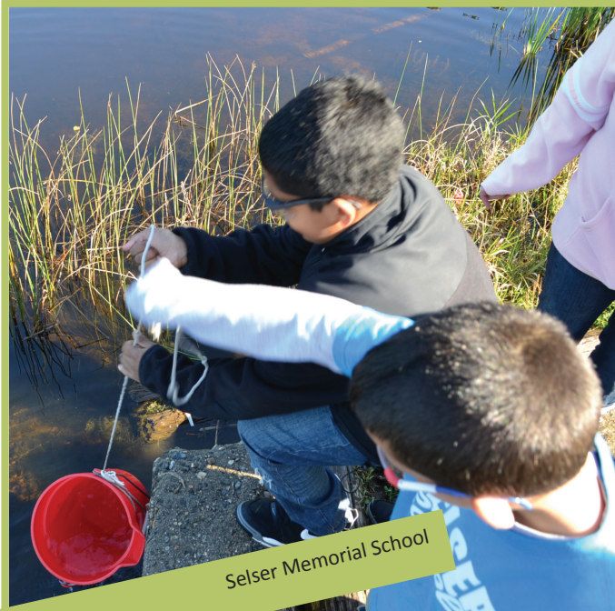
Students in Chicopee testing the "health" of the water at Chicopee State Park.