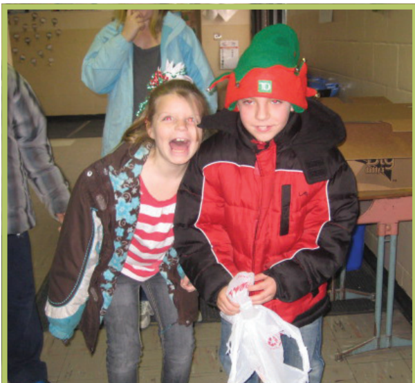
Selser Memorial Students in Chicopee, MA