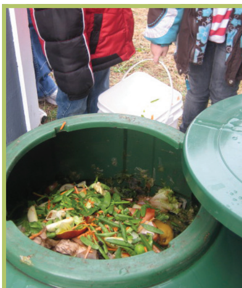
Selser Memorial School's Compost pile!